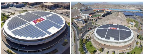
Figure 1.3. Wells Fargo Arena, topped with solar panels

The designers of the Arena Sport Gdynia, in Poland – Kar-czewski&Bernier Architectes [2] ATI Architektura Technika Inwestycje STALKO Kaczmarek S.J., realized the sports hall for basketball, volleyball and handball, according to FIBA standards, having capacity of 4334 visitors, on the site having surface area of 40.915 m 2 , with 9.100 m 2 of useful surface. The main arena has dimensions 25×48 m and is multi-purpose. It has excellent acoustic functional potential, so it can be used for concerts, fairs, exhibitions and other cultural events. It was opened on 22 nd December 2008 and it is the main sports facility of the professional Euroleague basketball club, Prokom Gdynia. The structure has an attractive structure, and it is remarkably correlated to natural environment, to the forest belt. A part of vegetative structure is fitted in the oblique façade, an earth bank which is simultaneously the thermal insulation which reduces energy consumption. The impression is of an unpretentious hybrid physical structure. The appearance of the sports hall is resembling the tortoise shell, which approximates a biomorphic sculptural form.