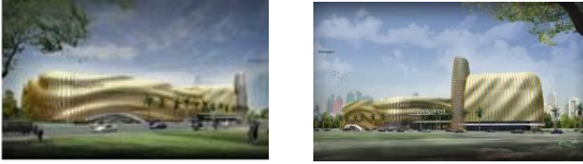
Figure 1.1. Archipelago Arena is a modern and iconic sports and exhibition building in Senayan, Jakarta

Key words: ecourbarchitecture, sports facilities, shaping, competitions, results