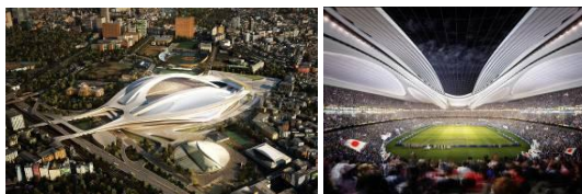
Figure 1.5. Zaha Hadid's winning design for Japan's new national stadium, which will host the 2019 Rugby World Cup

The Al-Khor Stadium will be one of the five new most contemporary stadiums intended for the World Football Championship 2022 in Qatar, in AL Khor, the city at a distance of 50 km north of Doha. The stadium will have a peculiar, asymmetric urbarchitectonic elongated volume having a shape of a shellfish with 45.330 of covered seats for spectators. It will be connected with several transport systems, and its parking lot will have the capacity of 6000 cars, 1000 taxis and 350 buses. There will be 1000 seats for media representatives. The stadiums will have a contemporary cooling technology allowing for a temperature of 20°C (36°F) at the stadium. Upon the completion of the World Championship, the seats of the upper part of the stadium will be dismantled and donated to the countries with less developed sports architecture. All five stadiums were designed by the German architects, Albert Speer&Partners [4].