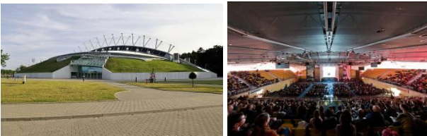
Figure 1.2. Gdynia Sports Arena