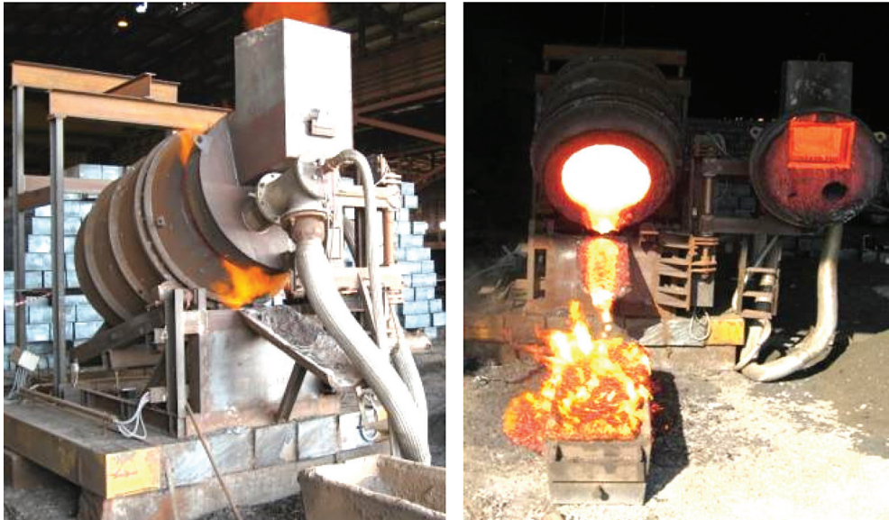
Fig. 1. Rotary tilting melting furnace

and steel. Substitution, even fractional, of high-quality materials for low-grade ones (oxidated, polluted, with inconsistent chemical composition) results in decreasing all melting characteristics, including power inputs and quality of molten metal.