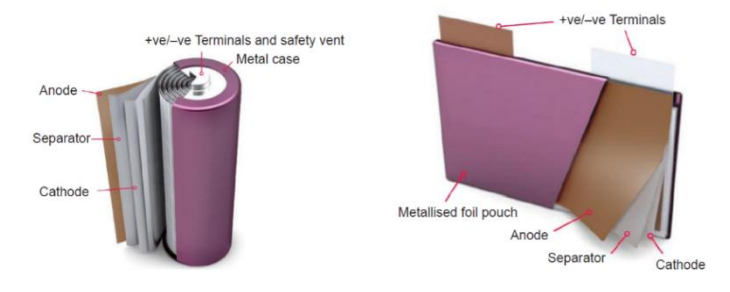
Figure 2: Lithium-Ion Battery Composition

consists of tens to thousands of individual cells packaged together to provide the required voltage, power and energy [1].