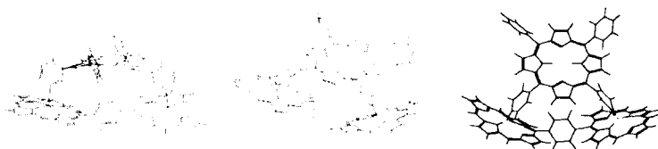
FIGURE 1 Optimized structures of porphyrin triads with various arrangement of the extra-ligand (HyperChem, release 4.0, PM3).

At present, it is well known that the initial energy conversion in photosynthetic reaction centers is the photoinduced electron transfer (PET) from chlorophyll special pair to monomeric pheophytin [1] . Correspondingly, a number of research groups have undertaken studies of PET between large \pi -conjugated tetrapyrrole molecules in various model systems [2-4] . According to [3] PET in this case can be characterized by a relatively small reorganization energy and a small inverse temperature dependence. Herein, we discuss the peculiarities of PET processes competing with the energy transfer in porphyrin triads on the basis of the experimental findings and theoretical calculations. Self-assembled triads of various but controllable geometry (Figure 1) were formed (using the extra-ligation effect [4] ) from a covalently linked Zn-octaethylporphyrin dimer (ZnPD) as the energy and electron donor and dipyrrolyl-substituted free base porphyrin (P) as the acceptor.