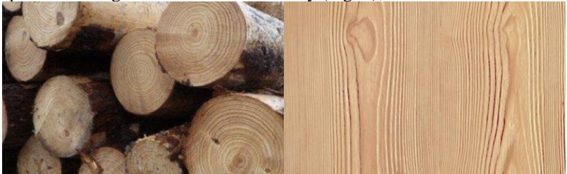
Figure 5 – Pine