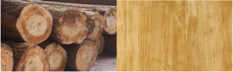
Figure 7 – Nanmu

– nanmu – corrosion resistance, no deformation, quietly elegant and delicate texture (Fig. 7).