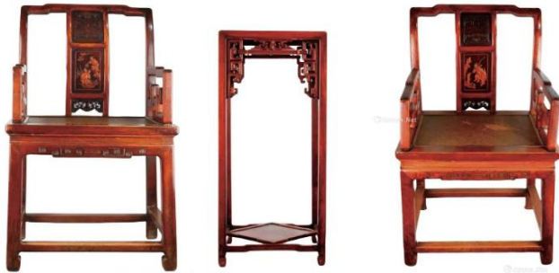
Figure 2 – The appearance of the mahogany furniture

and Qing dynasties thus unprecedented prosperity, and therefore the birth of Red-wood furniture.