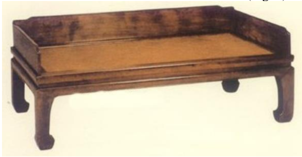
Figure 8 – Example diagram of pine furniture

In the Song, Yuan and early Ming dynasties, Chinese furniture used elm, pine, beech, nanmu and other raw materials of medium hardness (Fig. 8).