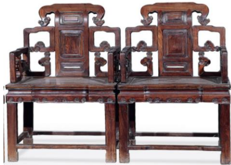
Figure 13 – First and middle period of the Qing Dynasty mahogany chair

– First and middle period of the Qing Dynasty (1616 – 1940) (Fig. 13).