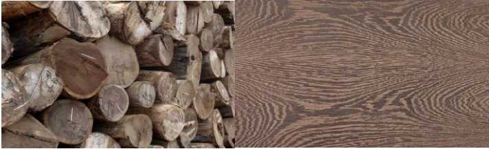
Figure 10 – Chicken wing wood

– Chicken wing wood (Jichimu): the texture is hard and fine, no brown eye lines, feel very smooth, beautiful texture, rich in changes, Guangdong and Yunnan have introduced the cultivation (Fig. 10).