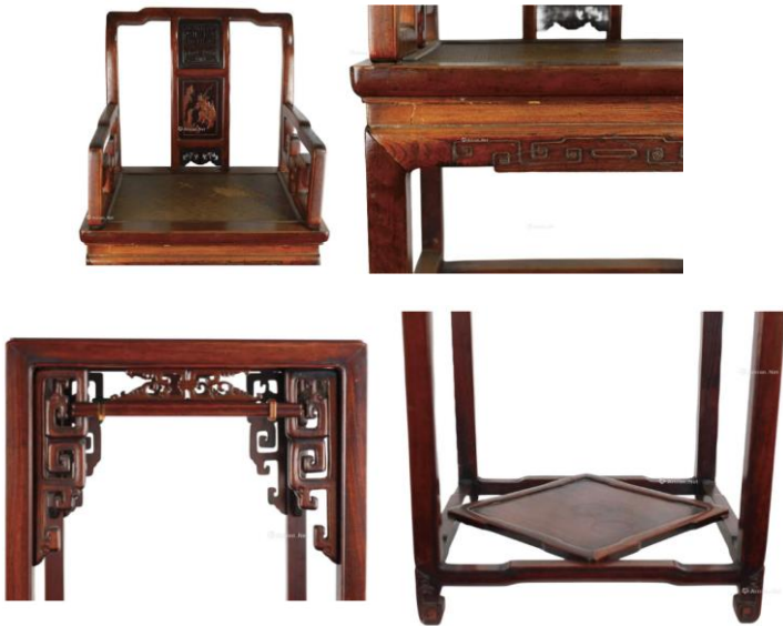
Figure 3 – Ming Dynasty mahogany official hat chair tea table a set (details show)