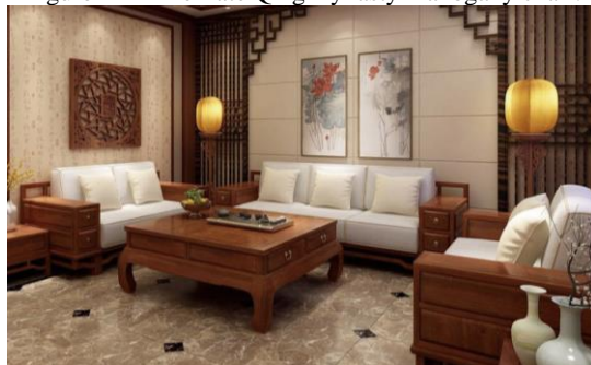
Figure 15 – Features of modern mahogany furniture

Features of modern mahogany furniture (Fig. 15):