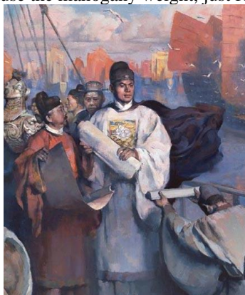
Figure 1 – Zheng He's voyages to the Western Seas

Redwood furniture began in 1405, through the Ming, Qing, late Qing three stages; when Zheng He brought the Chinese silk and porcelain, brought back is the main mahogany, because the mahogany weight, just for ballast (Fig. 1).