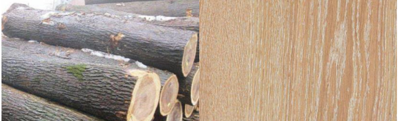
Figure 4 – Elm