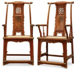
Figure 12 – Ming Dynasty mahogany chair

– The Ming Dynasty (1368 – 1644) (Fig. 12).