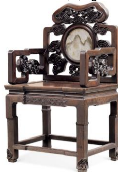
Figure 14 – The Late Qing Dynasty mahogany chair.

– The Late Qing Dynasty (1840 – 1912) (Fig. 14).