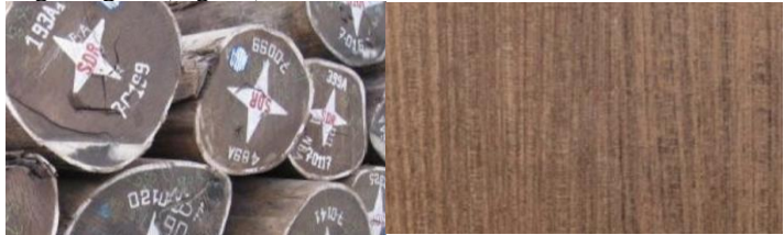
Figure 11 – Iron wood knife

– Iron wood knife: fine wood structure, slightly inclined texture, obvious core material and edge material, extremely heavy material, friction resistance, hard nature, strong strength, insect and ant resistant, corrosion resistance; produced in Guangxi region (Fig. 11).