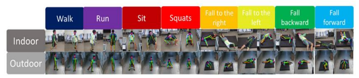
Figure 1 – Fall action display

When testing videos, this article first tests a single person on a monotonous background, as shown in fig. 2. the algorithm in this paper can clearly identify the state of the person being detected at the time of detection under a monotonous background, and promptly mark the fall status in red before uploading.