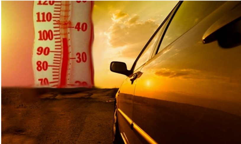
Fig. 2 – Heated Air Rises, Transferring Energy upward

Molecules of gases absorb kinetic energy from the flame. These molecules speed up and collide with molecules of the beaker. Molecules of the beaker, in turn, collide with the water molecules along the bottom of the beaker. The collisions transfer kinetic energy from one substance to the next.