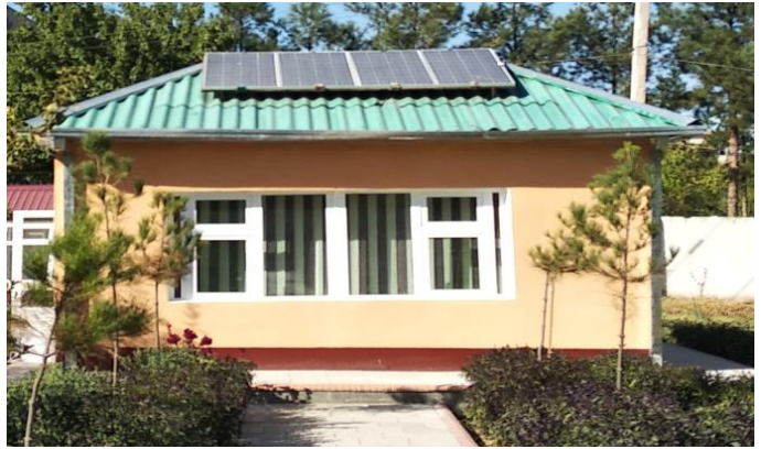
Fig. 1.1. An overview of the experimental research house.

Experiments are required to substantiate and study the thermal parameters of the building. An experimental house design was designed and built to conduct our experiments and research. The experimental research object (hereinafter referred to as the research object) had a single-storey, one-room structure built on a concrete foundation made of baked brick, and the thermal regime, hot water and heating loads of the object were determined (Figure 1.1).