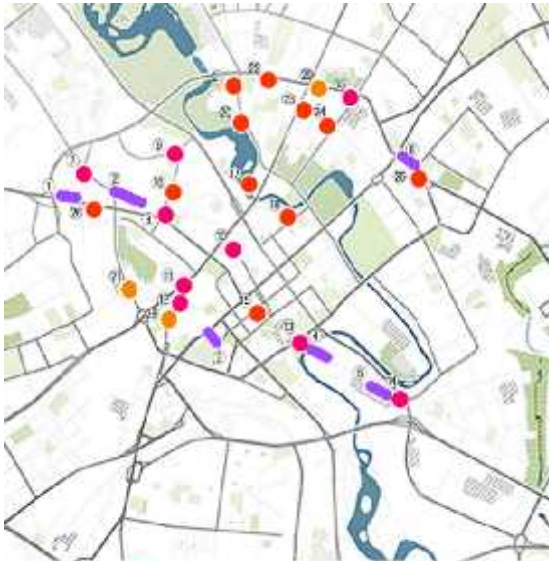
Транзитные Карманный парк (на пересечениях улиц) Карманный парк (в застройке) Парикеты . 1.