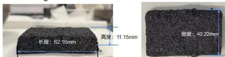
Figure 1 – Biomass carbon sample

After that, we used common agricultural waste straw to make biochar, and conducted SEM, BET and FTIR tests on the carbonized straw material. Biochar material can be well formed, and can keep the shape floating on the water surface and has a certain hydrophobicity. The forming condition, pore size, specific surface area and hydrophobicity of the material are well maintained. Finally, the straw residue mixture was determined as the raw material for biochar preparation. The experimental samples are shown in fig.1 below.