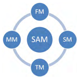
Figure 1 - Four Motives of Strategic Alliance (SA)

Although, learning and internalization of core competencies is one of the key motives behind alliance strategies (Taylor, 2005), strategic alliances often result in failure because of human resource management during the post-alliance integration period (Yalabika, 2013). However, enhancing knowledge about the positive and negative outcomes of the SA should direct future research and contribute to a reduction in alliance failures through improved managerial practices (Ireland et al., 2002). SA should sustain common goals, strategies, and pursued these collectively (Sebalj et al., 2007).